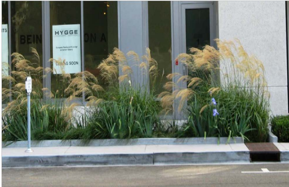
Hope Street, Downtown Los Angeles