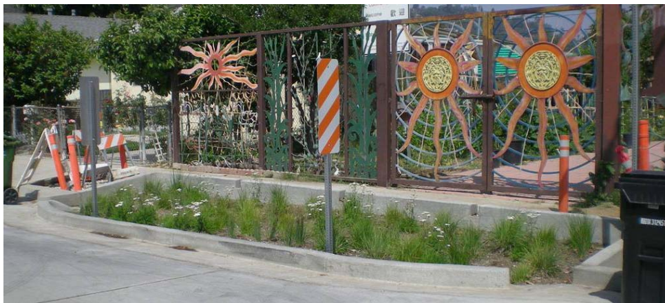
Riverdale Avenue Project, City of Los Angeles